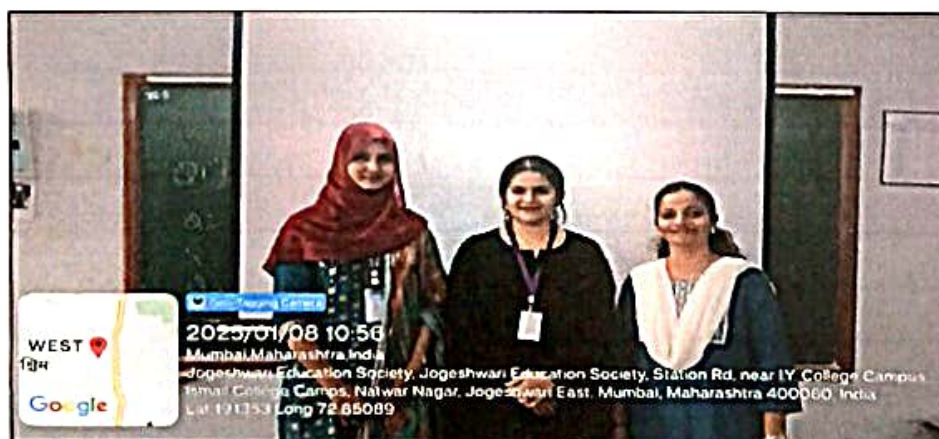
Seminar on "Campus to Corporate"