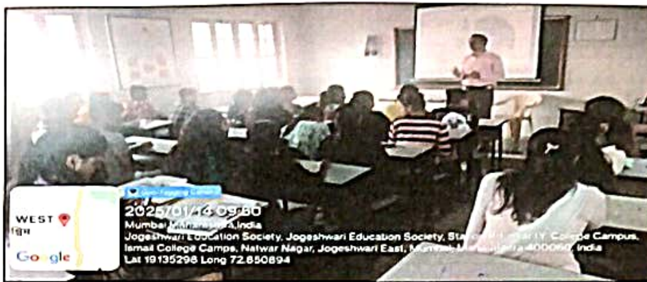
Seminar on "Professional Transitions: From Graduate study to Career Excellence"