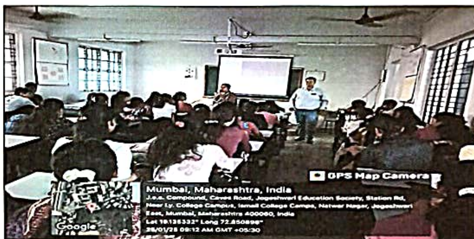
Seminar on Preparation for different Competitive Exams