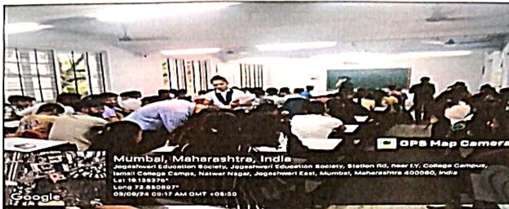
Seminar on "From Runway to Skyway: Join the Fly High Journey"