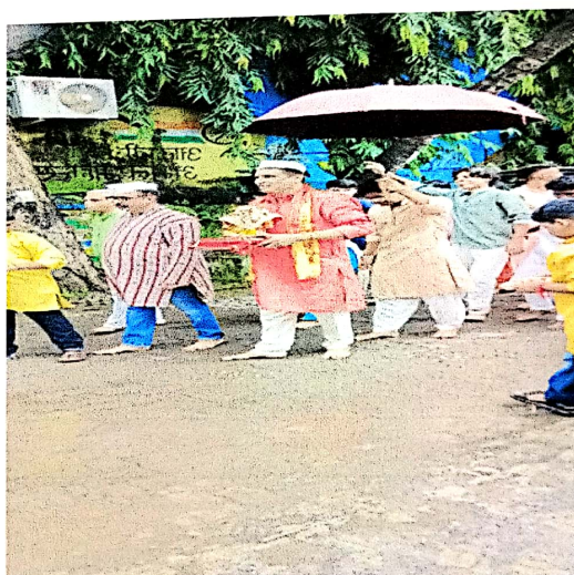
Ganesh Chaturthi Celebration