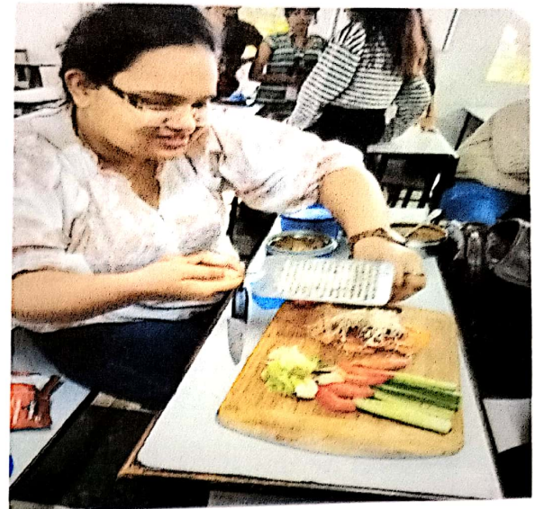
Salad decoration Competition