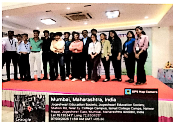
PRIZE DISTRIBUTION CEREMONY