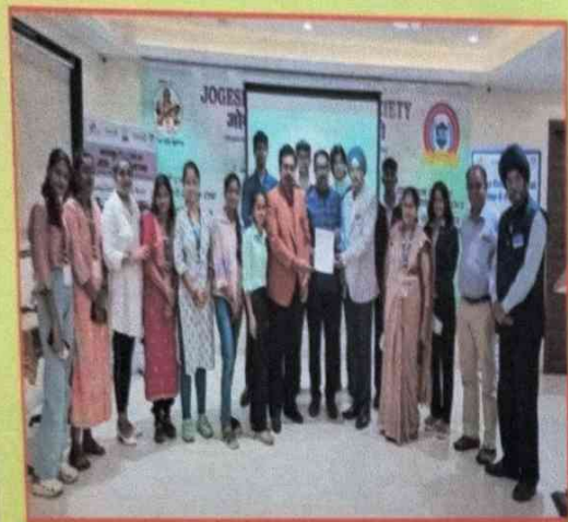
FREESHIP GIVEN TO 20 STUDENTS BY PRESIDENT OF RCMSEP - 10th October 2024