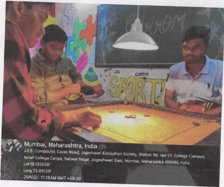
Mumbai, Maharashtra, India J.E.S. Compound, Caves Road, Jogeshwari Education Society, Station Rd, near I.Y. College Campus, Ismail College Camps, Natwar Nagar, Jogeshwari East, Mumbai, Maharashtra 400060, India Lat 19.135038° Long 72.85128° 29/8/22, 11:15 AM GMT +05:30