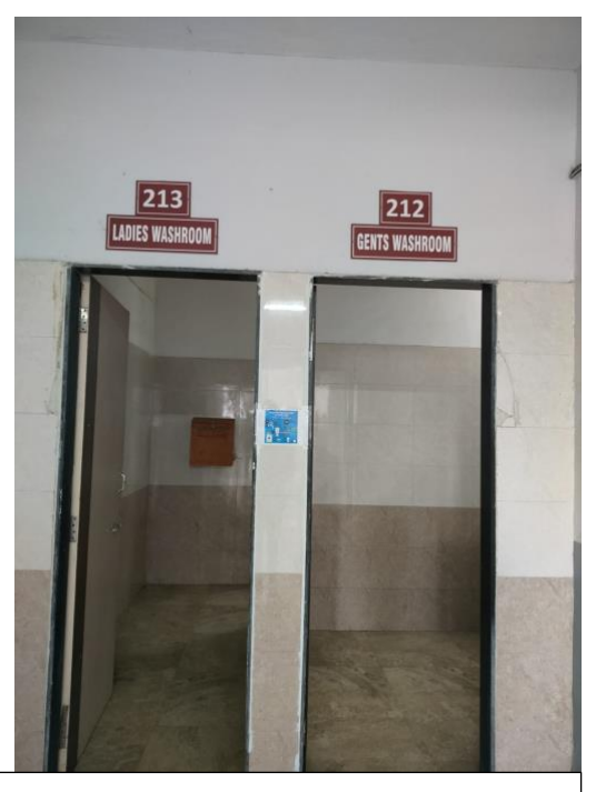
WATER CONSERVATION MESSAGES DISPLAYED