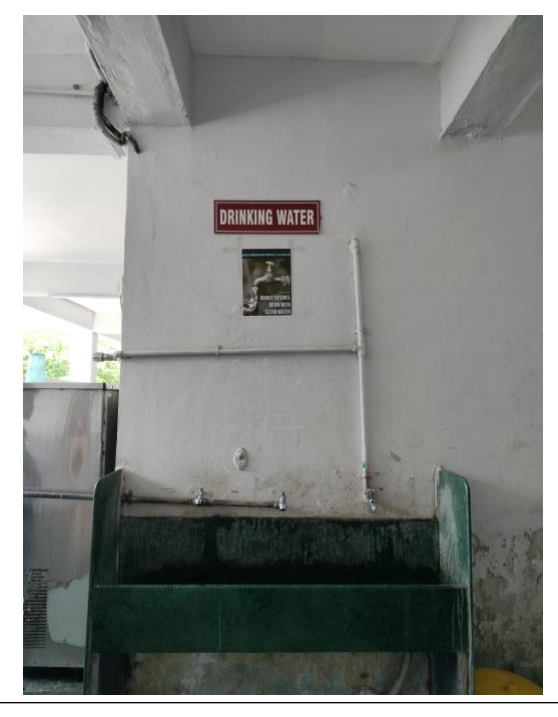
DRINKING WATER FACILITY