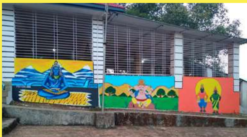
At NSS Camp held at Palghar NSS students conducted eye camp, painted the temple and distributed blankets to villagers.