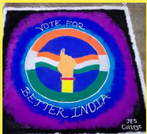
NSS students did Rangoli at Voters Office