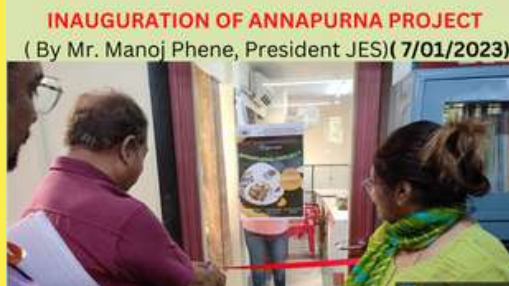
The objective of the project was to protect Girl Child and sensitize them about healthy breakfast eating habit.