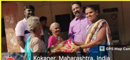
Kokaner, Maharashtra, India